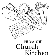
FROM THE Church Kitchen